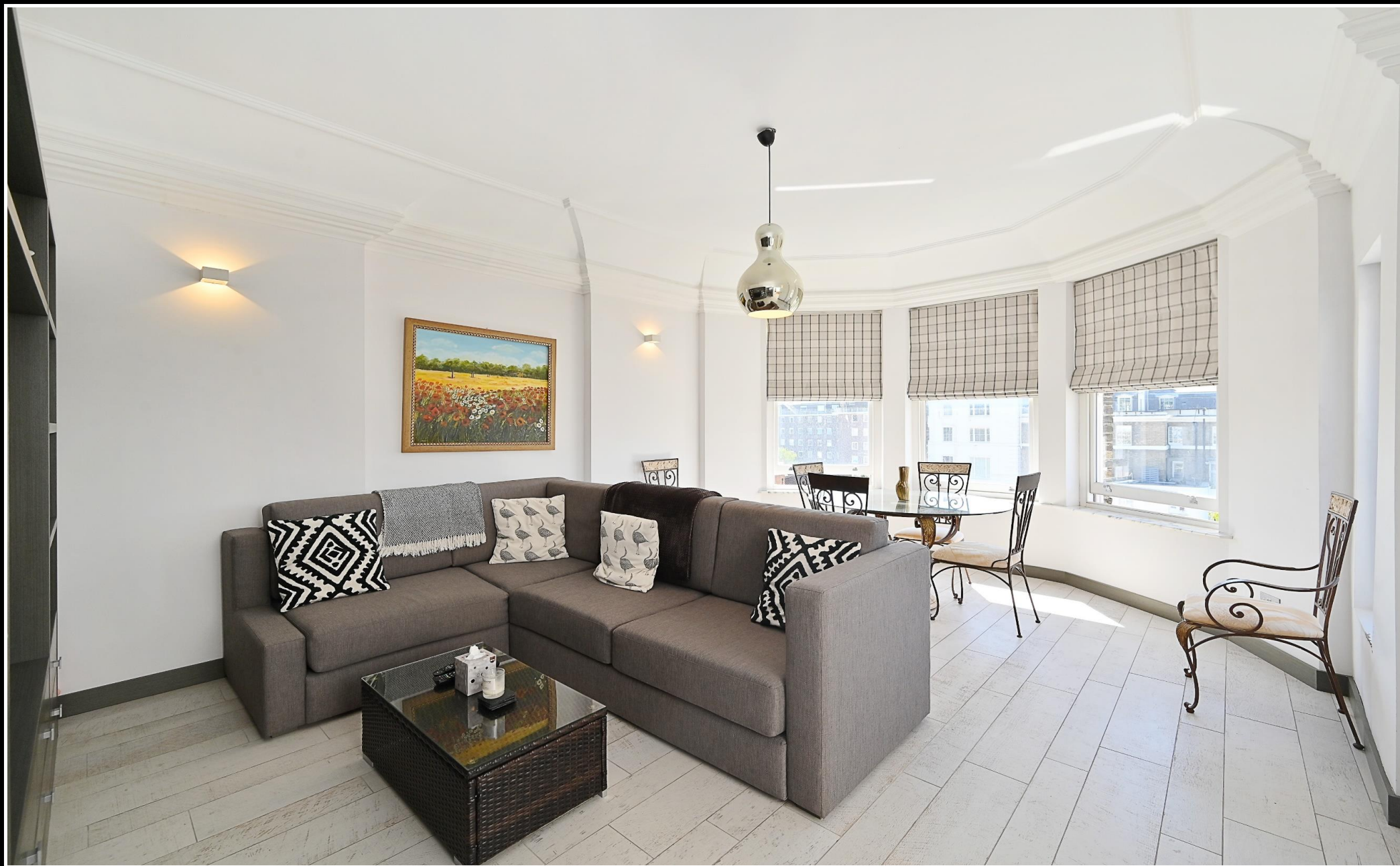
Hyde Park Square, W2 £1,200,000, Leasehold